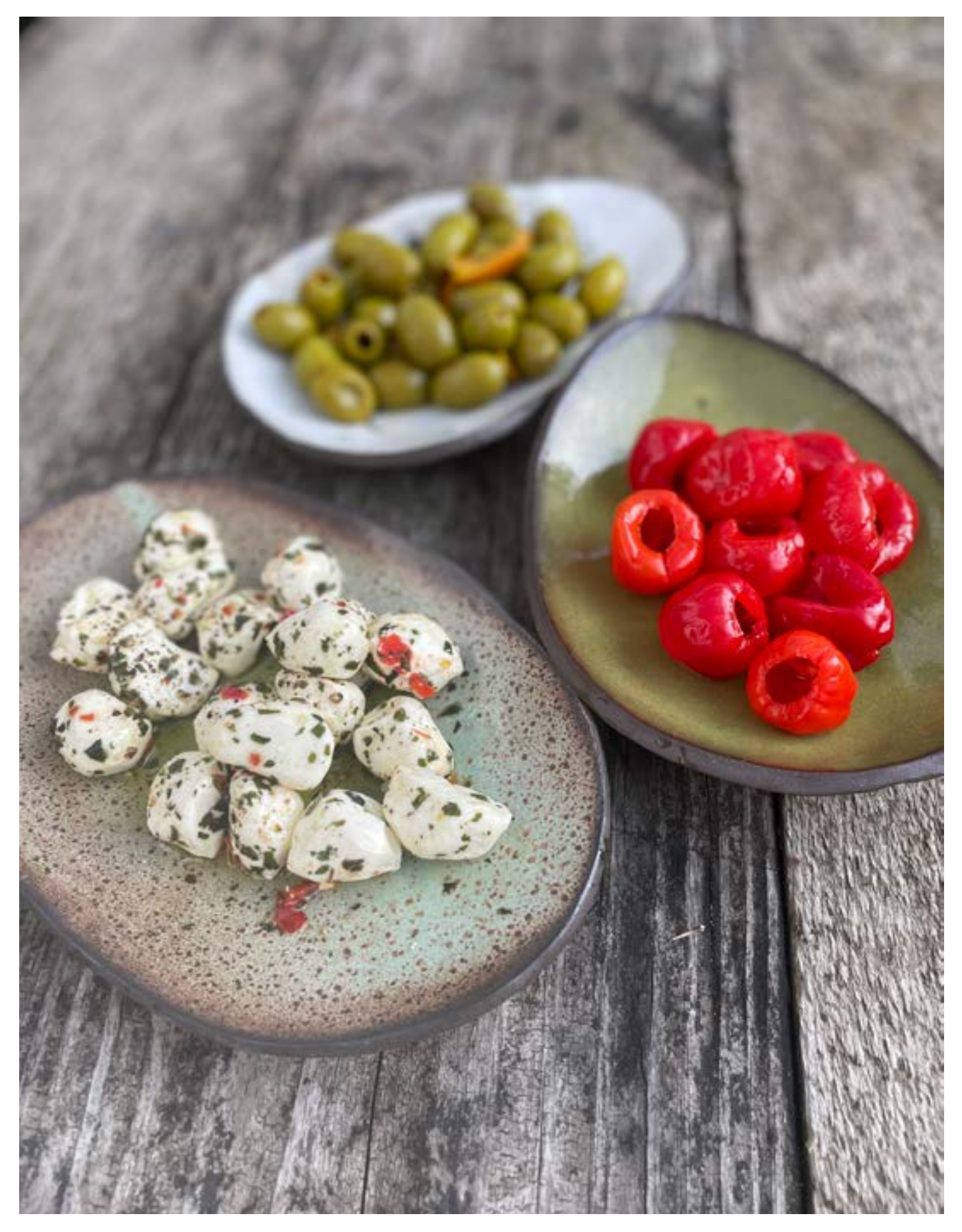
Small Stackables in Pistachio, Avacado and Linen