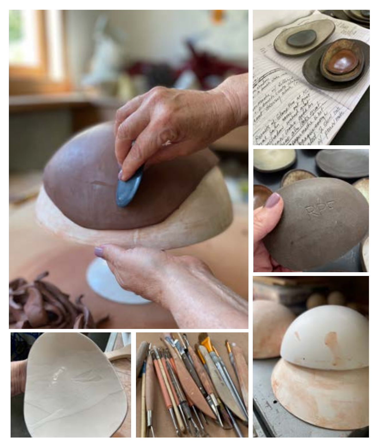
The ceramics made in the studio are all crafted by hand. Each piece goes through many stages as it travels from wet clay to the finished piece. Crafting cermaics is often an unpredicable process, where no two pieces are ever exaclty the same. This uniquness is where we find beauty.